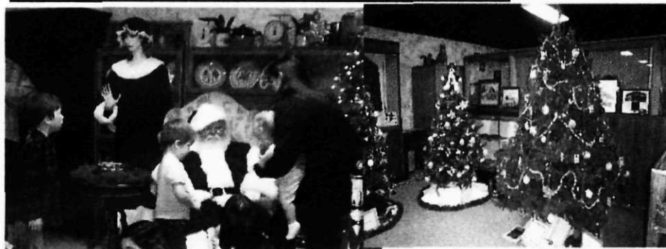
Another great holiday season!