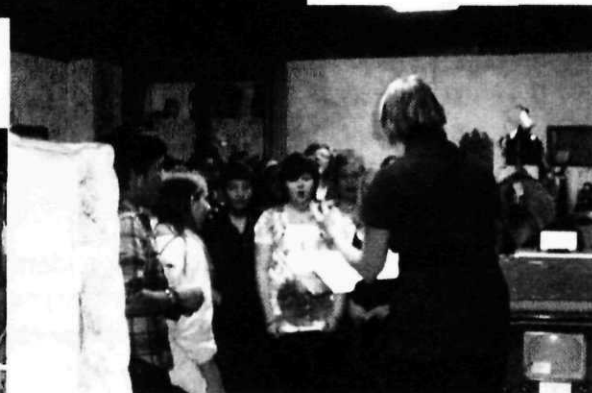
Memorial Junior High Choir

The following is an article that appeared in the LARC newsletter. We wanted to share it with our LHS members.